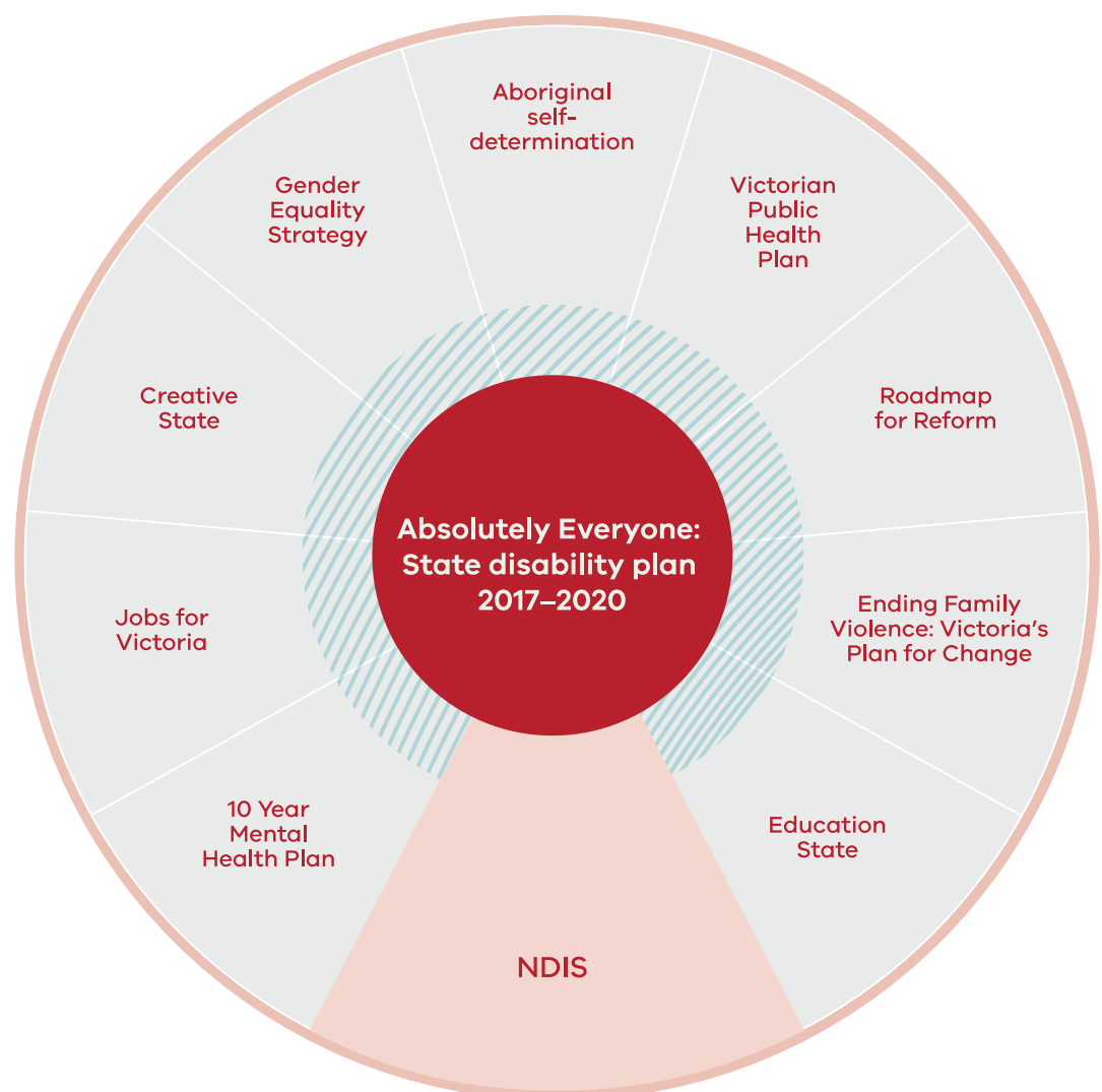
Figure 2. The state disability plan and other government plans

The vision of this plan will be vital as the Government introduces key reforms in a wide range of social and economic policy areas. Some of the other key government strategies and plans that support the state disability plan are shown in Figure 2.